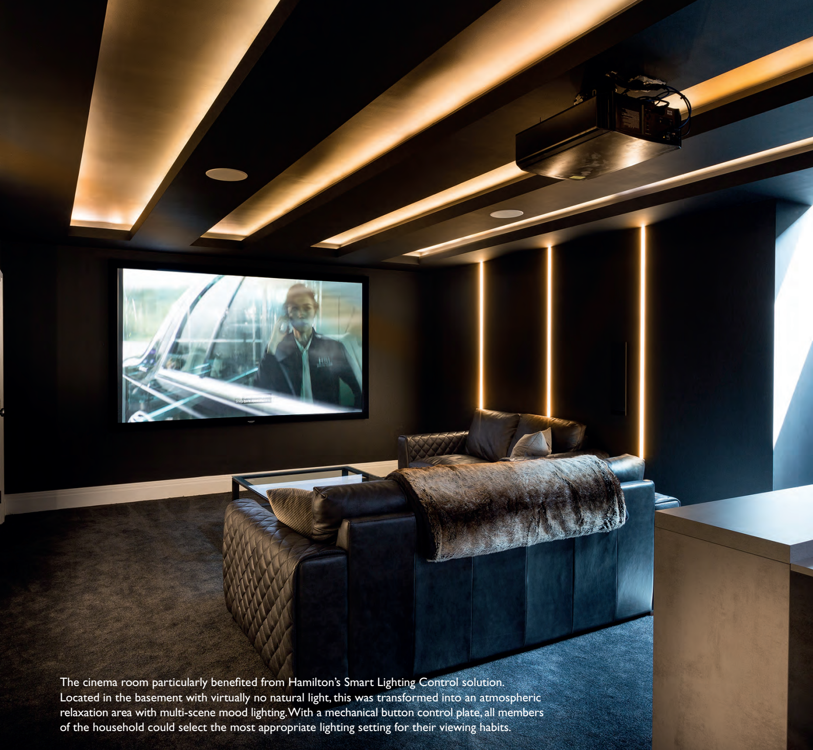
The cinema room particularly benefited from Hamilton's Smart Lighting Control solution. Located in the basement with virtually no natural light, this was transformed into an atmospheric relaxation area with multi-scene mood lighting. With a mechanical button control plate, all members of the household could select the most appropriate lighting setting for their viewing habits.