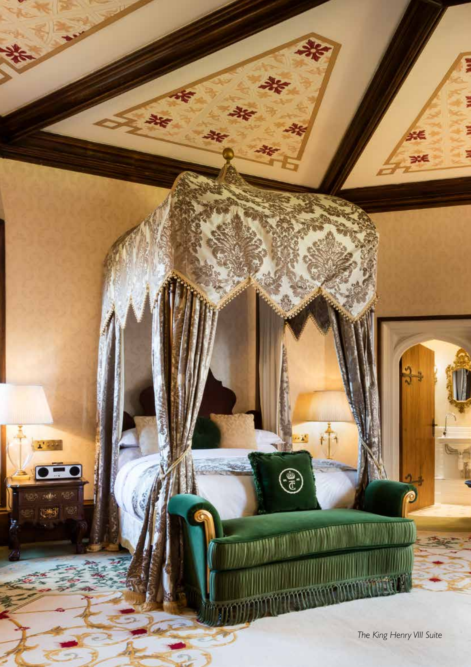
The King Henry VIII Suite