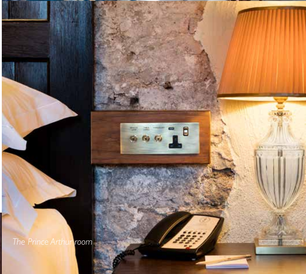
The Prince Arthur room