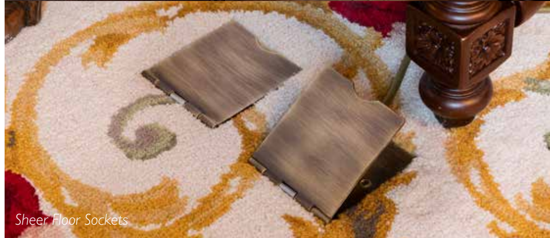
Sheer Floor Sockets