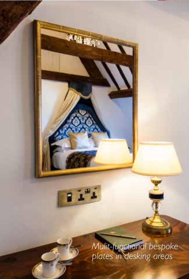
Mult-functional bespoke plates in desking areas

“ I've worked with Hamilton numerous times and have always been impressed with the quality of work they bring to a project. Knowing Hamilton's ability, and I must say willingness to take on a brief for short run custom-made plates, sets them apart from other companies. A British manufacturer working on a very British project, it couldn't have been a better fit. ”