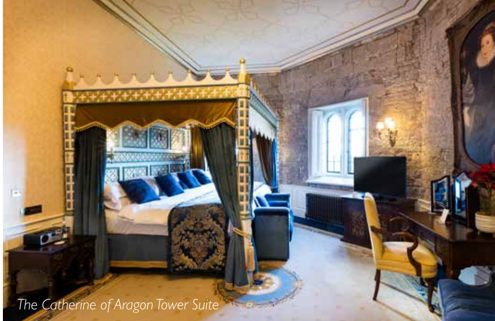
The Catherine of Aragon Tower Suite

The desking area in each bedchamber required a second multi-functional bespoke plate. Sheer CFX® was again used for continuity, and the plate comprised: Double Switched Socket with Dual 2.1A/1A USB Charge Points plus an RJ45 CAT6 outlet for internet access. Everything one would need for using a laptop and to recharge other smart devices.