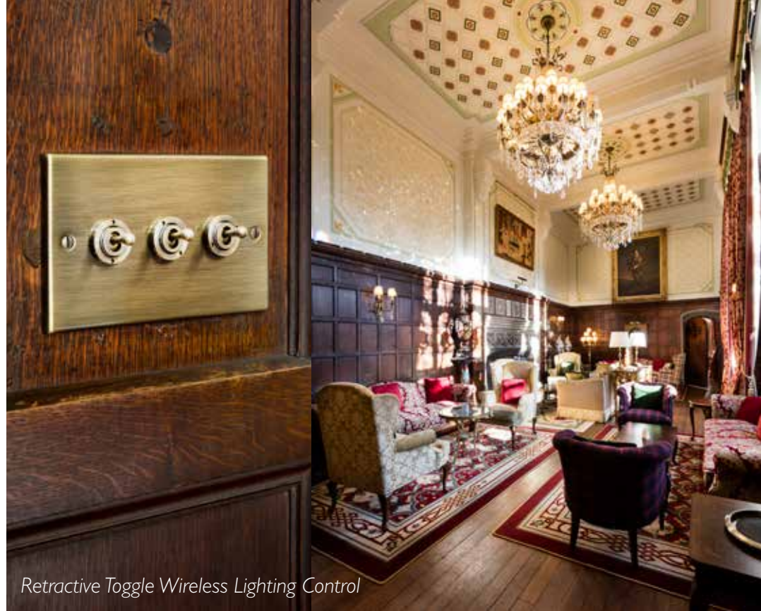
Retractive Toggle Wireless Lighting Control

Each suite has a palatial bathroom, with either an ornate slipper bath, a walk-through wet room styled shower, or both. A Hartland shaver socket finished in bright chrome with black inserts was installed to complement the bathroom's polished chrome tapware, delivering a feel of luxury-meets-stately-opulence.