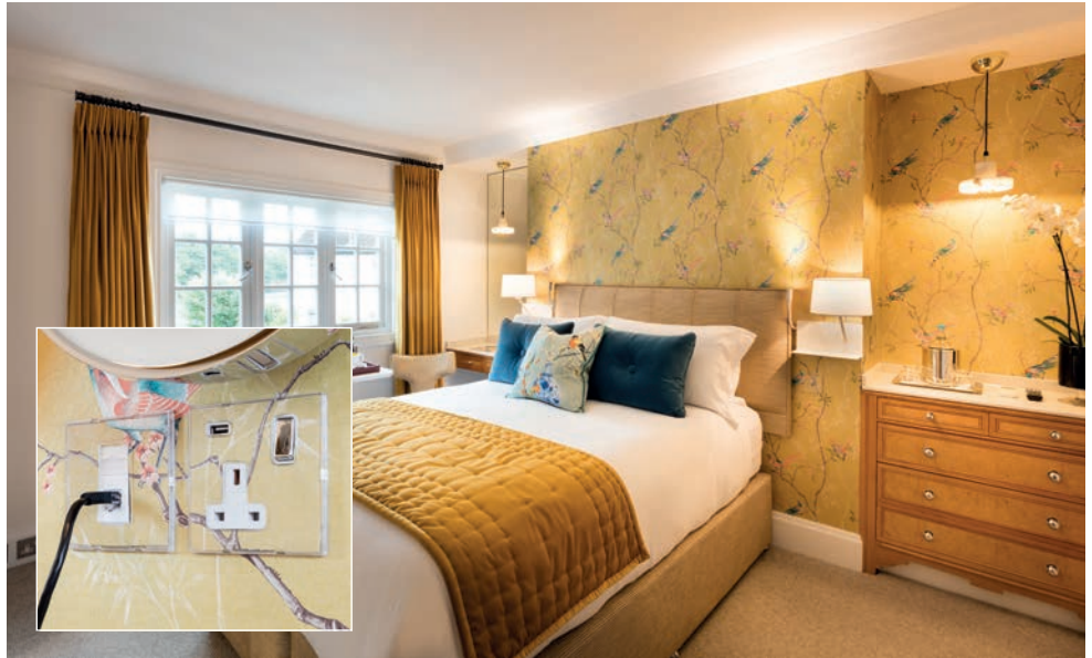
Le Nid Jaune, translates as 'yellow nest'.