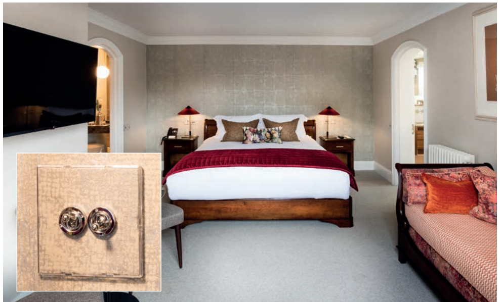
La Terrasse is elegant with bold accents in a serene setting.