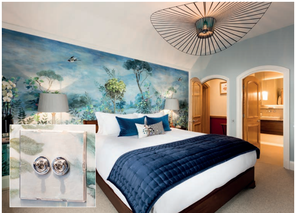
La Tamise, means 'Thames'.